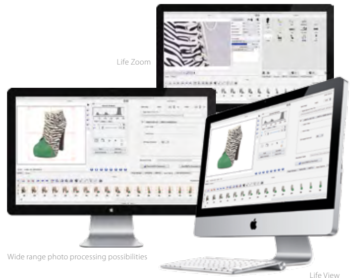
Wide range photo processing possibilities